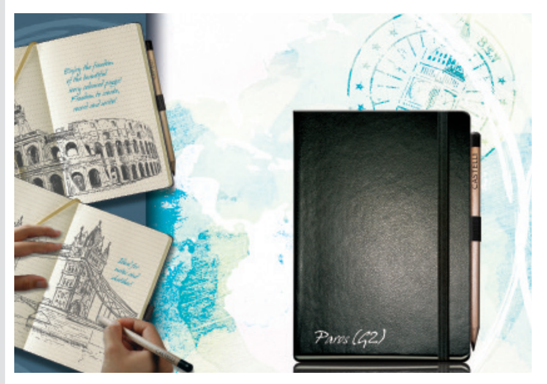
Paros notebook from "Ivory" collection

20,000 orders each year 5,000 stock products each year 1,5 million individual branding personalisations performed