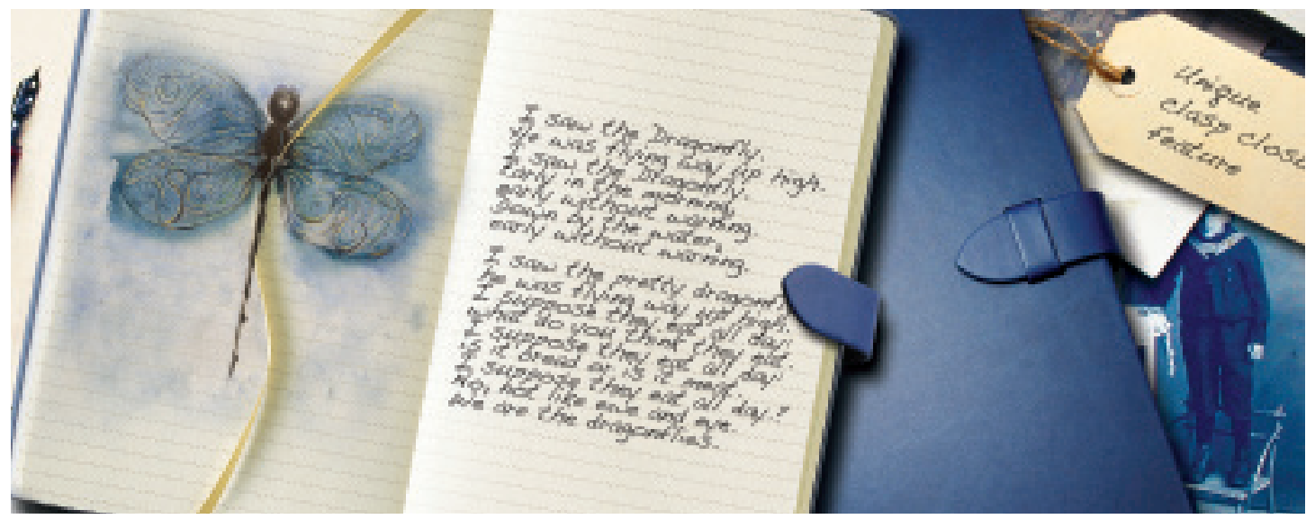
Mirabeau notebook from "Ivory" collection